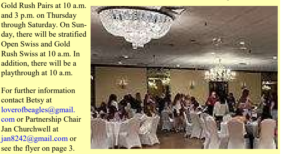
White Eagle Events and Convention Center

The schedule includes stratified Open Pairs and